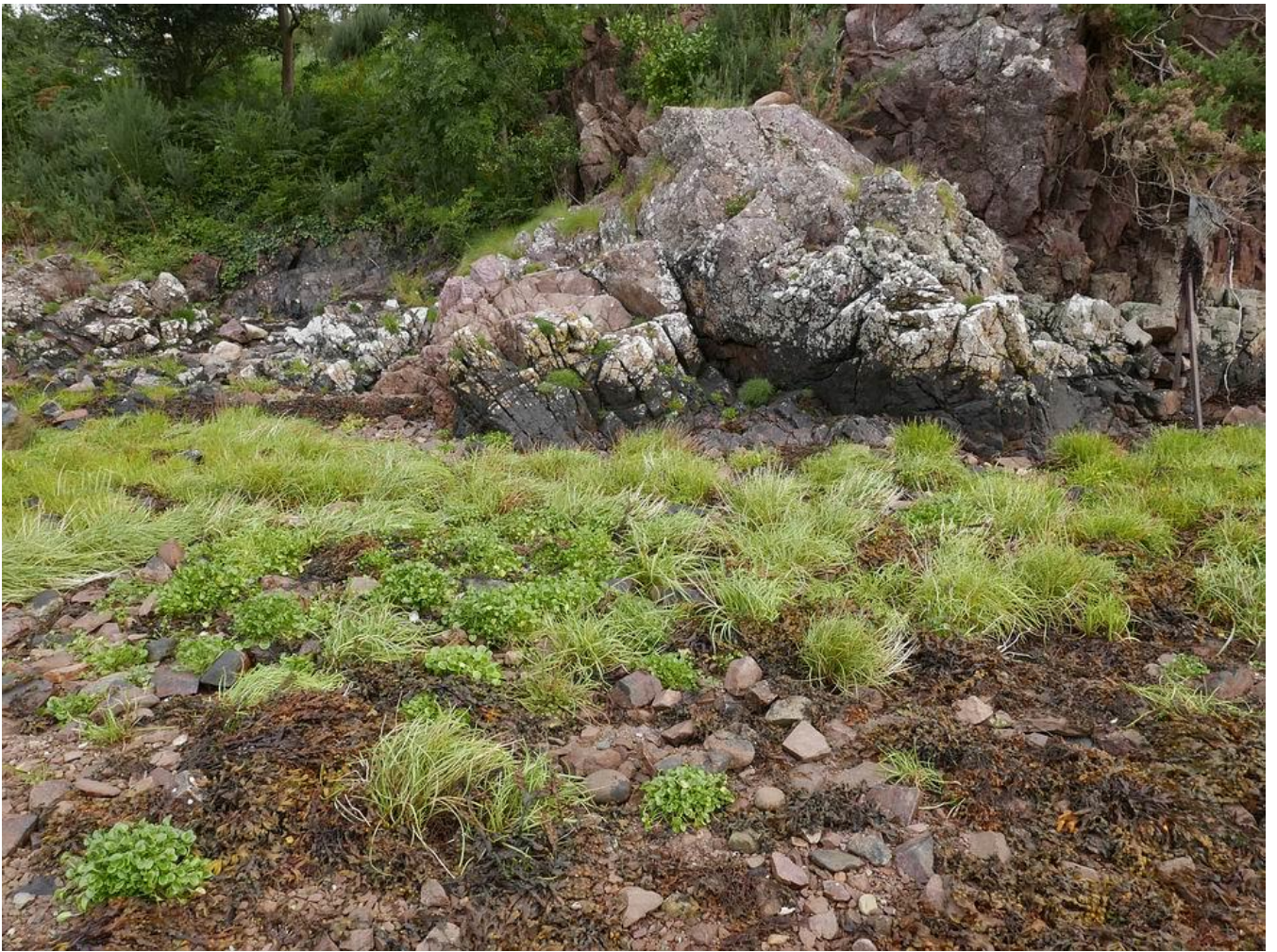
Seaweed, salt marsh and rocks.