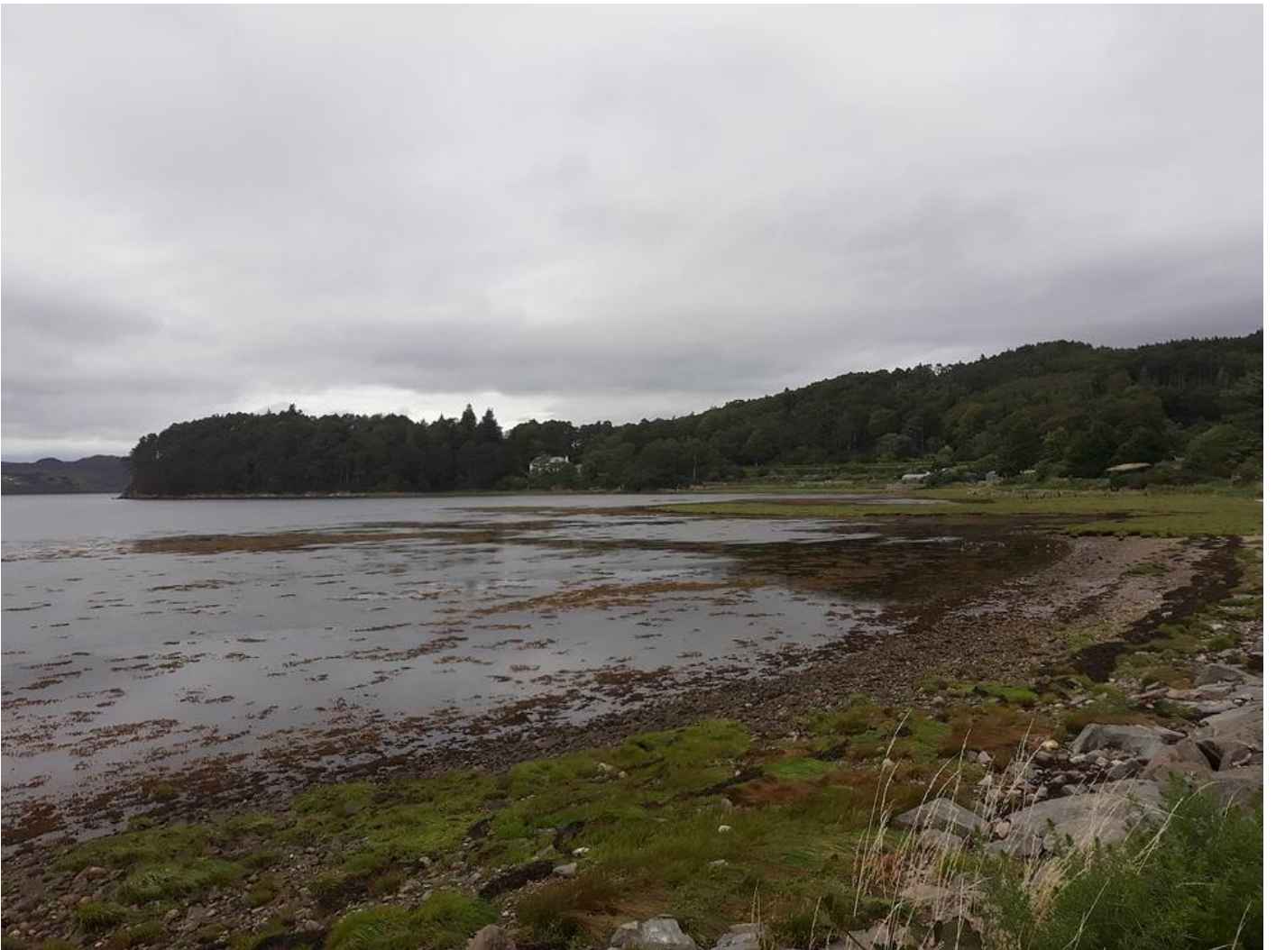
This is the view before me as I walk along the foreshore and salt marsh towards the Inverewe peninsula.