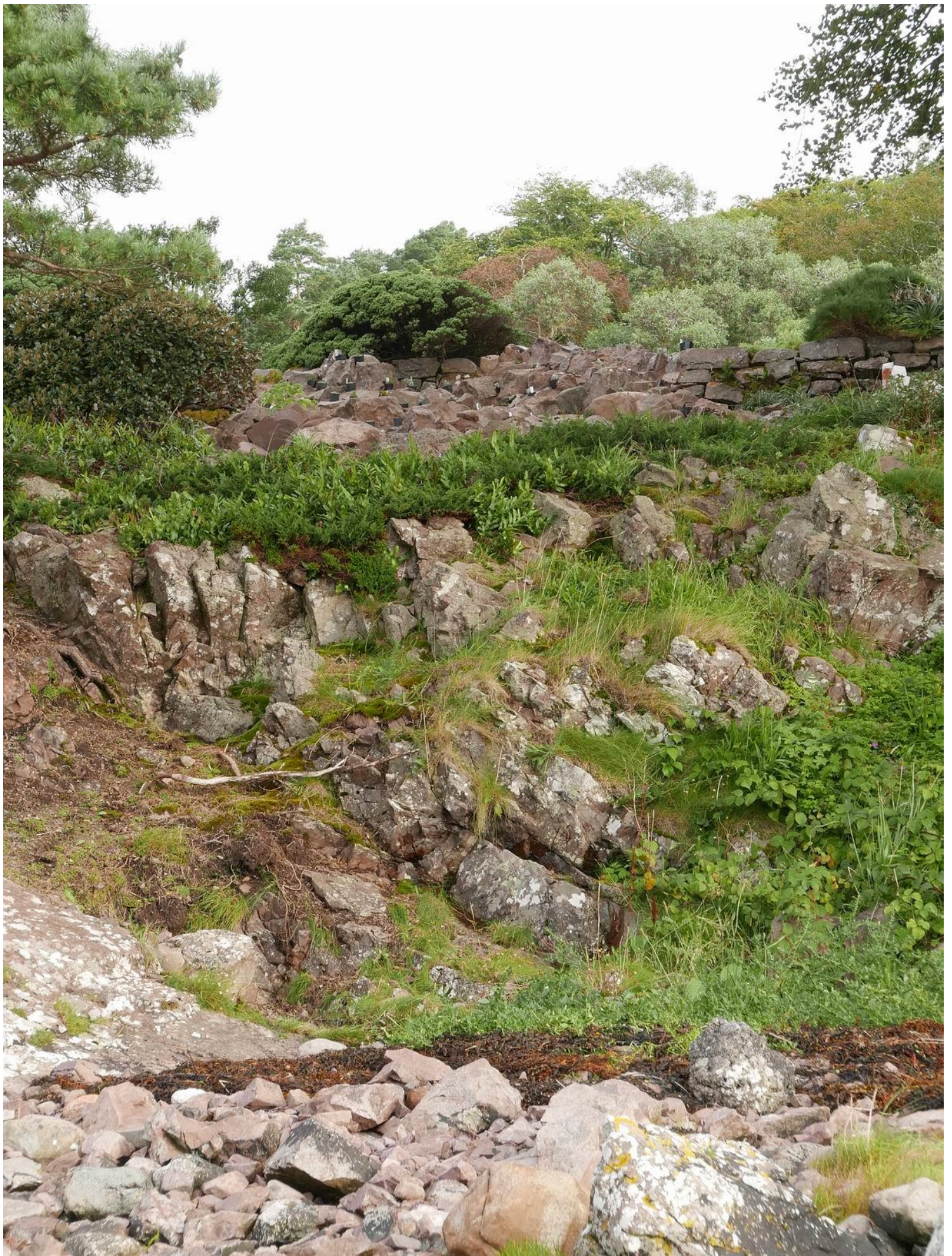
This image shows the link between our crevice garden creation sitting above the natural rock outcrops rising from the shore line.