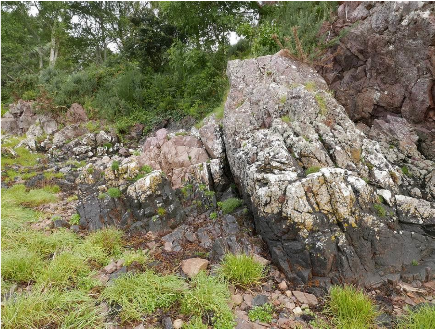
Here is the natural crevice garden shown on the front cover.