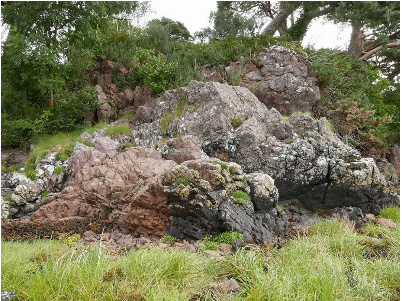
A stunning sequence of rock formations provide a home to many wild plants.