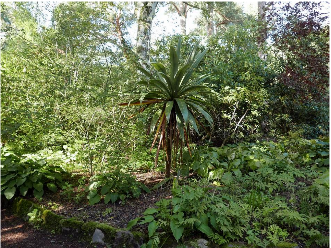
I think that this is a form of Cordyline australis one of many New Zealand plants which are a feature throughout the garden – I am prepared to be corrected by anyone with more knowledge of these.