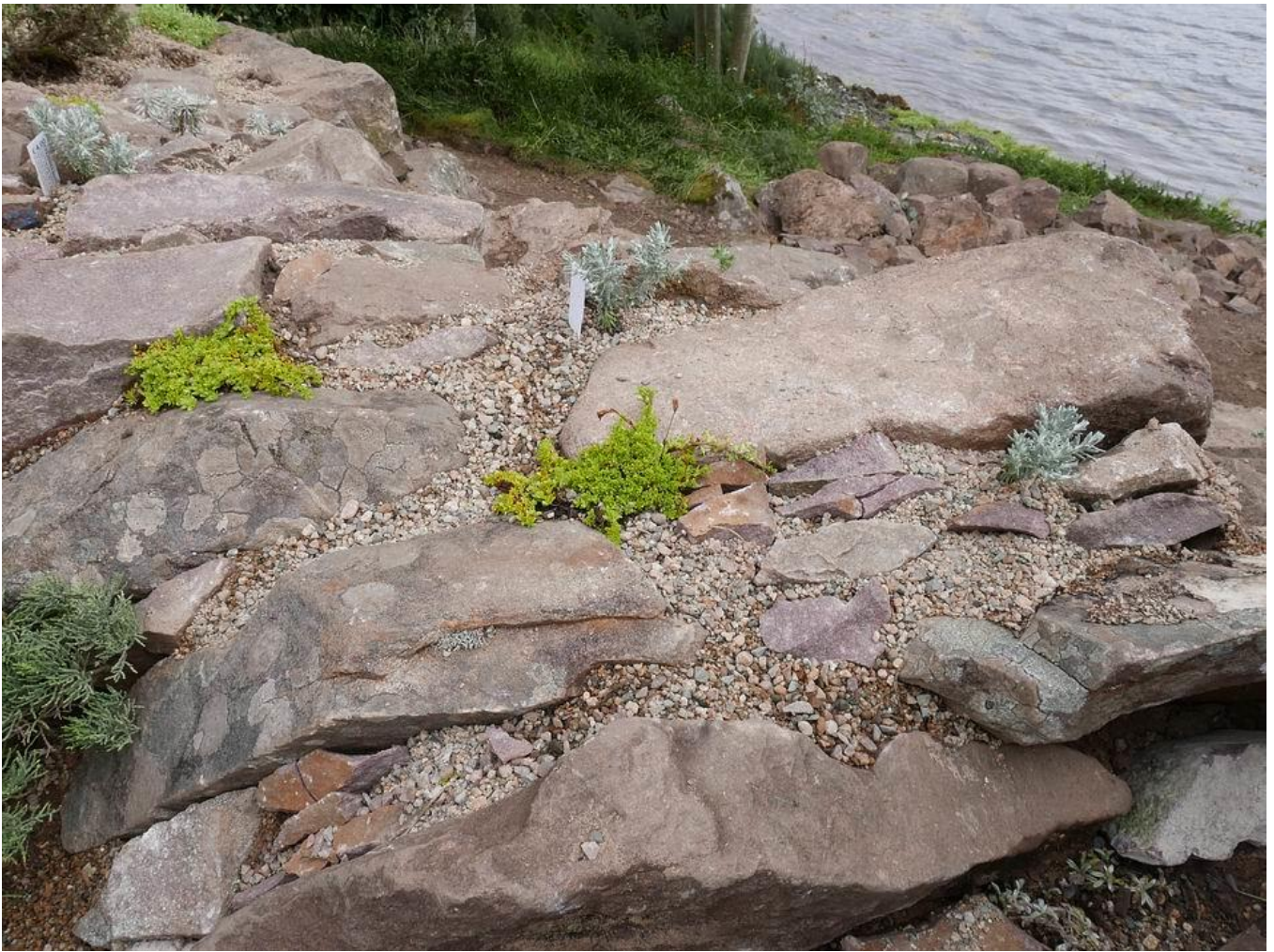
Newly planted crevice garden.