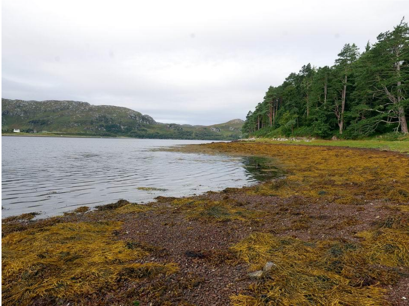
Low tide reveals the seaweeds which when used as a mulch provide a rich source of humus and nutrients.