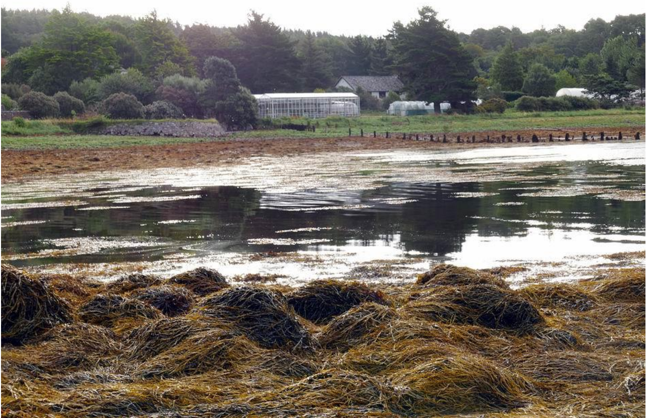
The superb propagation glasshouses at Inverewe have a magnificent view across the loch to the mountains beyond.