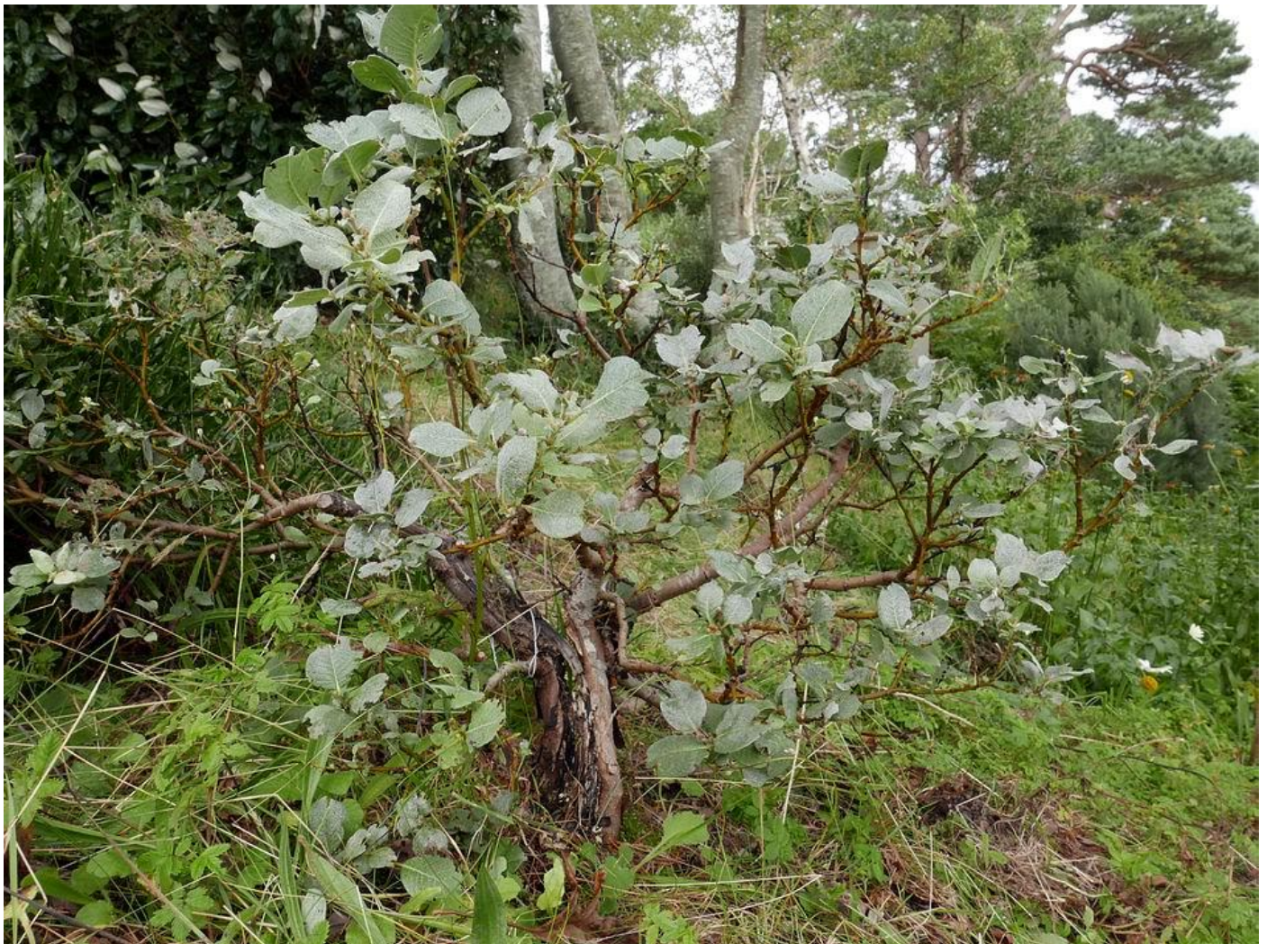
Despite its small stature the rotted, hollowed out trunk of this Salix lanata reveals its great age.