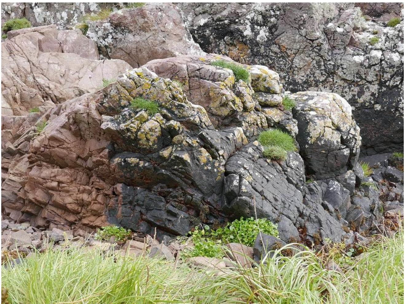
Armeria maritima has a root hold in the cracks of the rocks with Cochlearia danica growing among the scattered rocks.