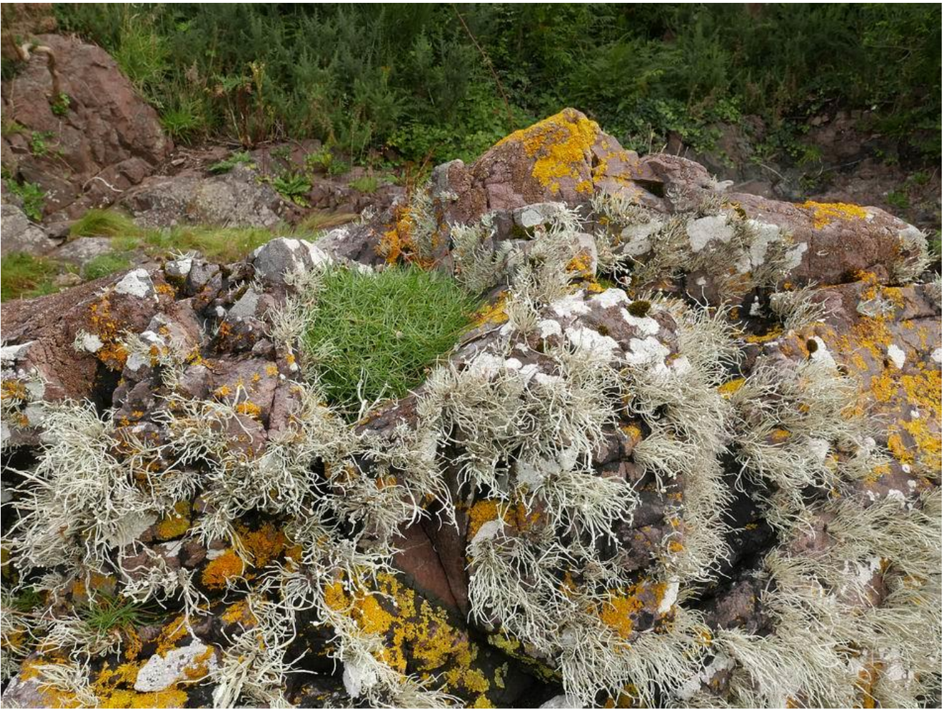
Armeria maritima and lichens