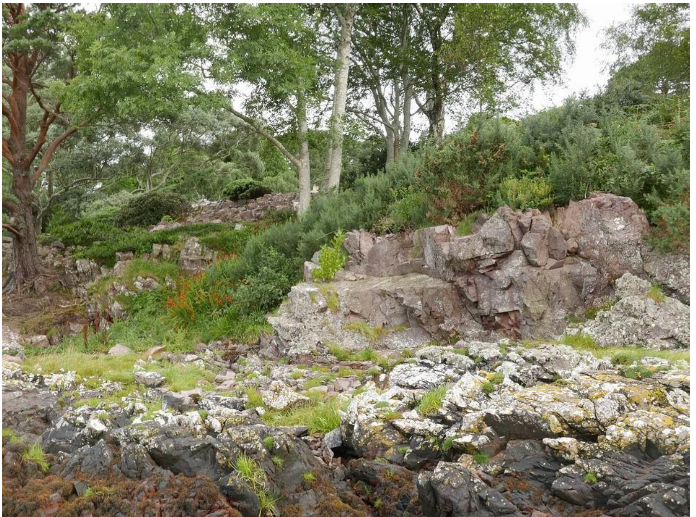
You can see our crevice work sitting above these natural rock gardens (to the left).