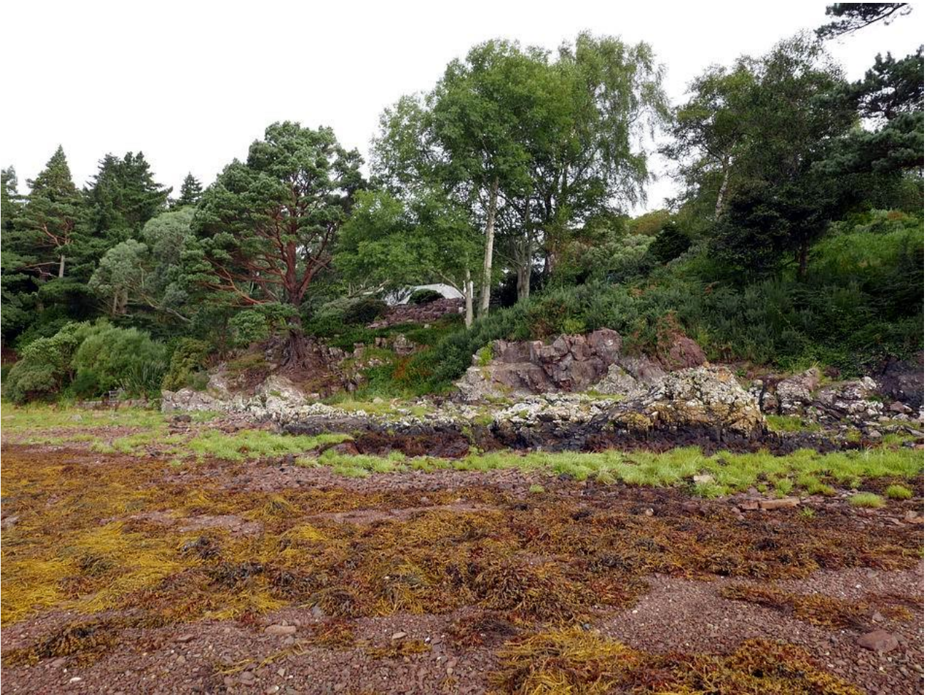
From the shore the land rises steeply up to the garden but for the next sequence of pictures I stay on the loch level.