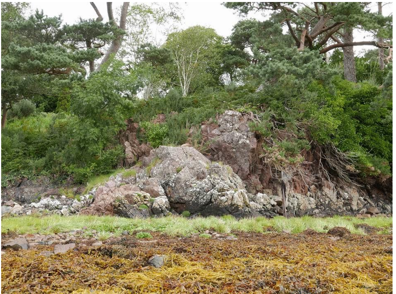
I love this transition from seaweed garden through salt marsh, rock garden rising up to the woodland.