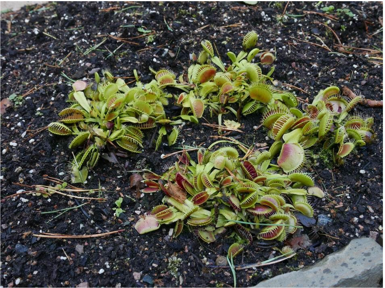
Also growing very well in this moist bed is the Venus flytrap ( Dionaea muscipula ).